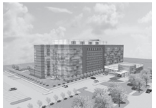
Architectural rendering of the new Imaging Research Facility