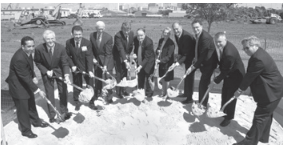
Representatives from the UT Health Science Center at Houston, the UT M. D. Anderson Cancer Center and GE HealthCare came together April 10 to break ground for the Center for Advanced Biomedical Imaging Research in the UT Research Park.

Ground was broken April 10 at The University of Texas Research Park in Houston for a joint research facility dedicated to developing novel agents and